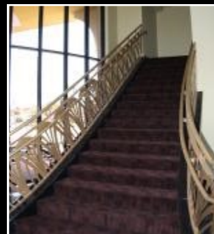
THE VILLAGE AT SPORTS CENTER SECOND FLOOR